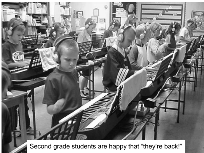
Second grade students are happy that "they're back!"

The students will be learning scales, chords, note reading, rhythms, composing, and other skills on the electronic keyboards. They progress from non-symbols to the traditional note-reading symbols. Kindergarten students are using the Area 4 kristal bell set, along with their other activities.