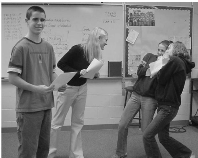
Freshmen practice their readers’ theatre, “Three Swine of Most Small Stature.”