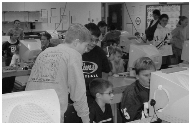
Seventh graders creating presentations for their election project.

In October, students were introduced to the second phase of their project. Each group gathered information received from the departments and candidates, in addition to other sources including the Internet, newspapers, speakers, and books. Students used class time in social studies to investigate their assigned positions, candidates and depart-