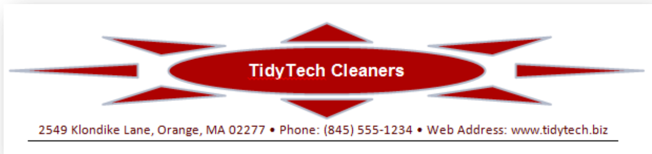
FIGURE 1 – Letterhead